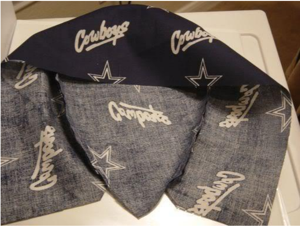
THIS IS HOW THE BACK OF YOUR HAT WILL NOW LOOK.