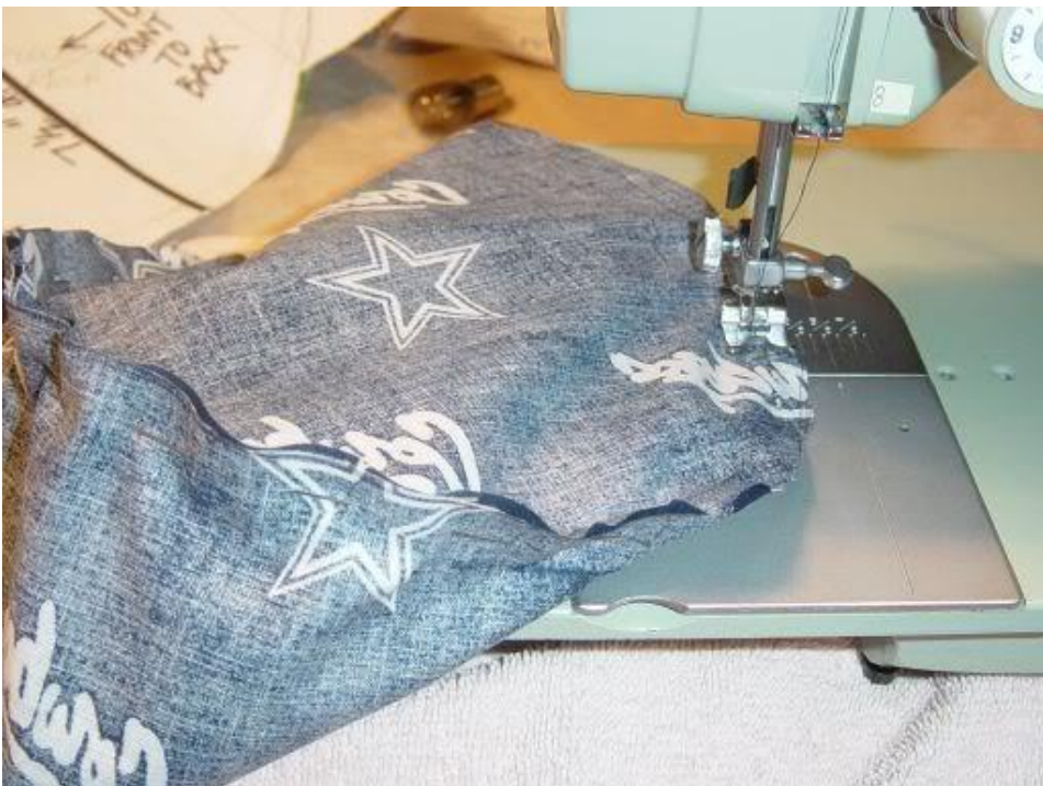
SEW AROUND TOP. I SEW AROUND AGAIN ON OUTSIDE OF SEAM JUST SEWN, TO HELP PREVENT FRAYING.