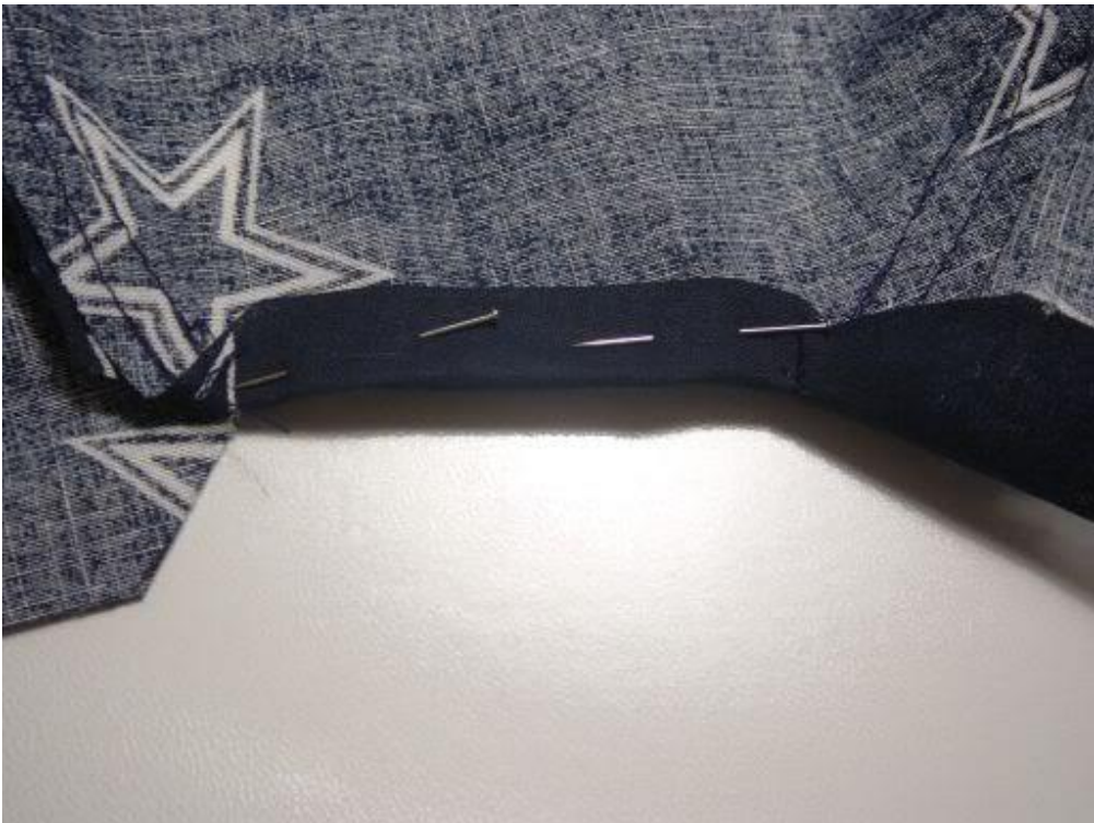
ROLL UP THE POINTED PART OF THE HAT TWICE (ABOUT 1/2" TURNS) AND PIN