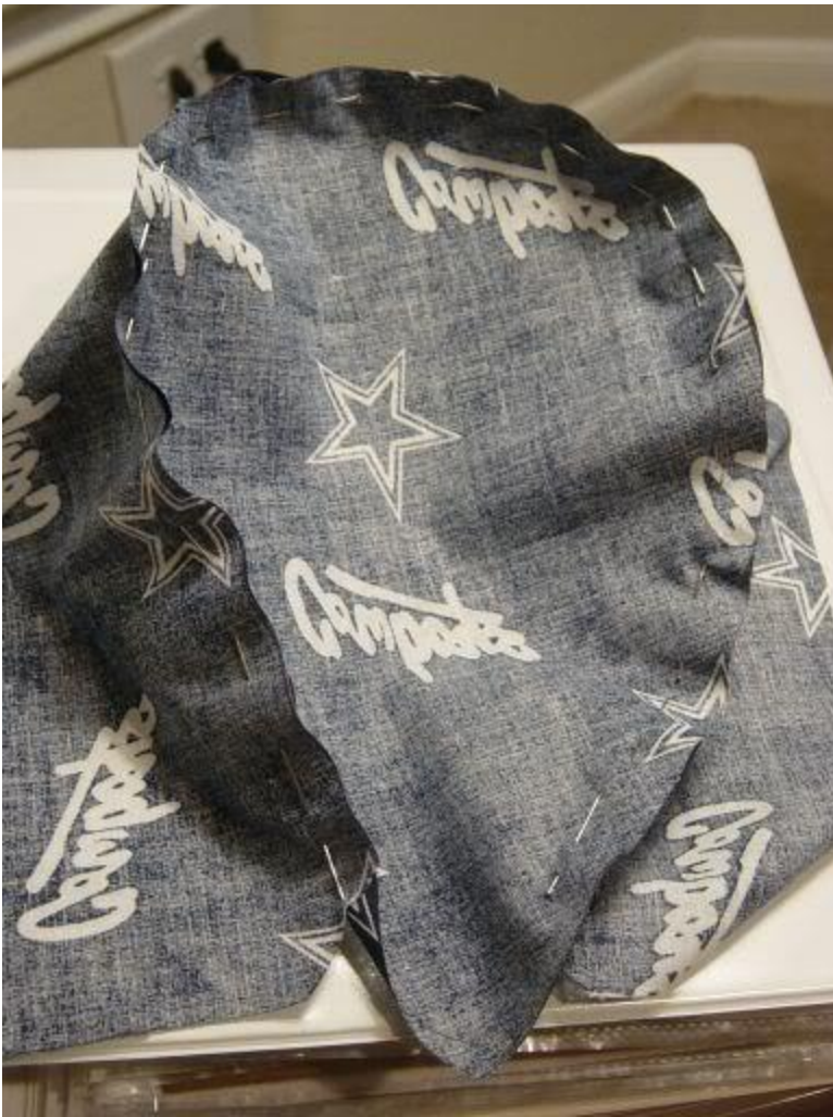
HOW HAT WILL LOOK ALL PINNED UP