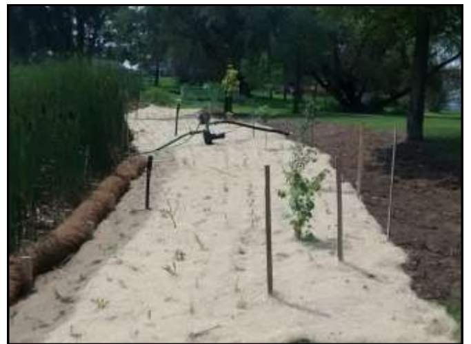
Shoreland Restoration: MPCA 319 Grant