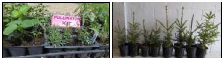
Native Plant Kits & Potted Stock