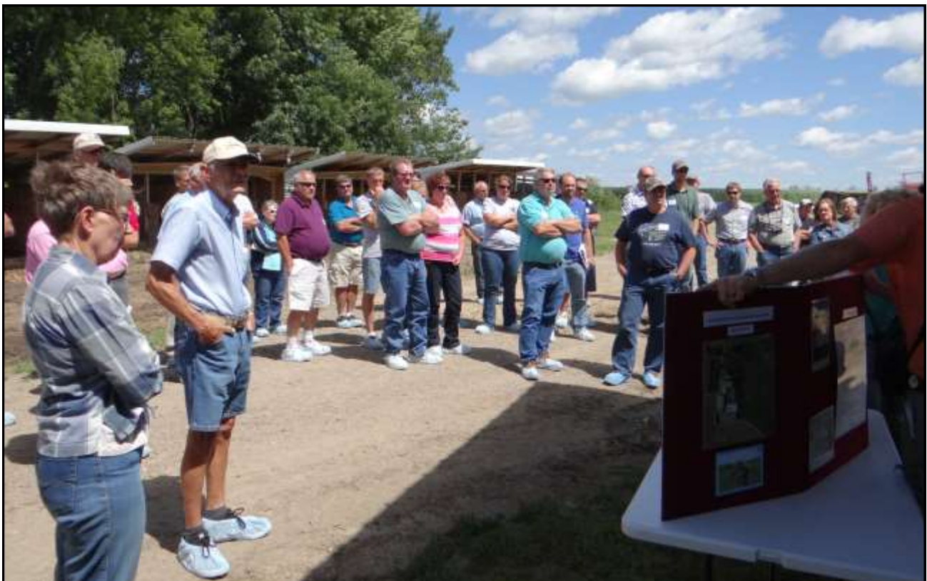
Conservation Tour and 50th Anniversary Open House on July 29th, 2015