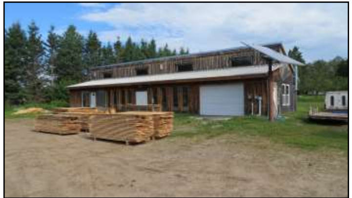
Top: Greg Nolan and Marcia Rapatz Bottom: Solar Powered Wood Kiln