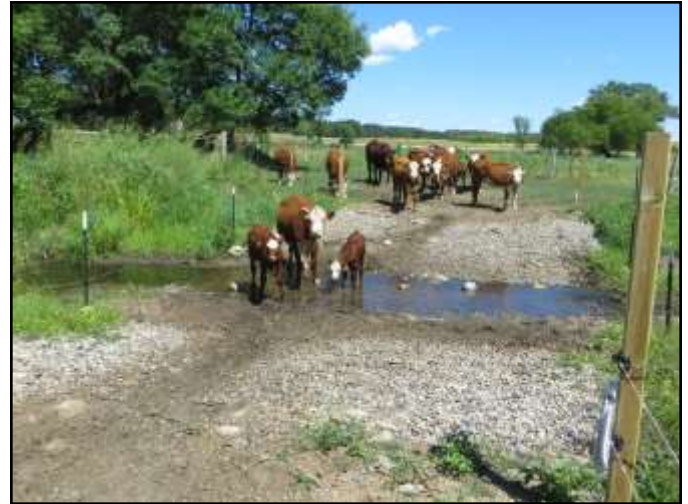
Cattle Crossing: State Cost Share