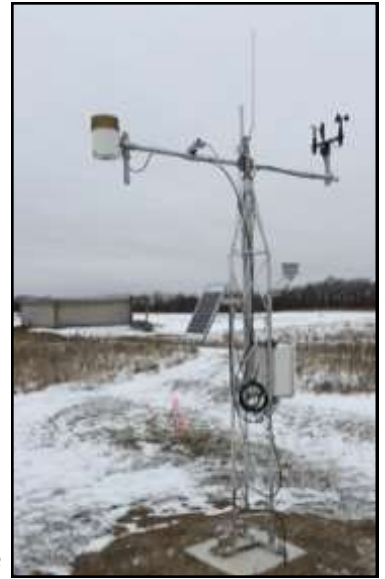
Clarissa Weather Station