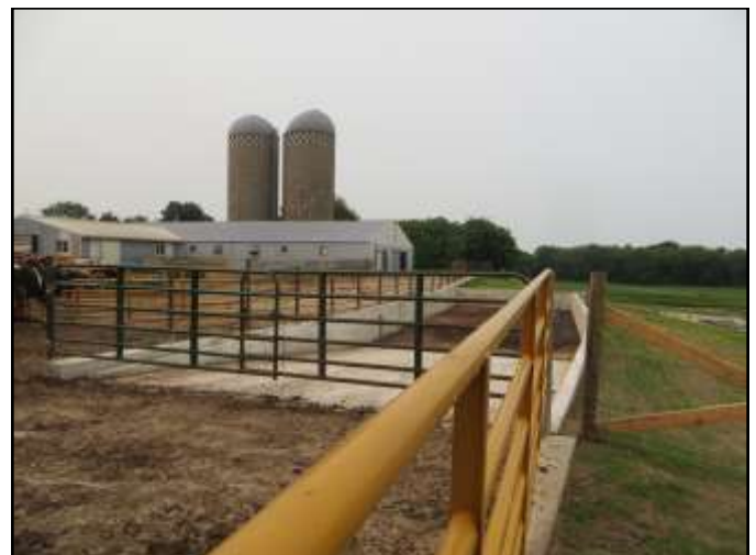
Ag Waste with VTA: CWF Livestock Mgmt.